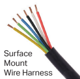
Surface Mount Wire Harness