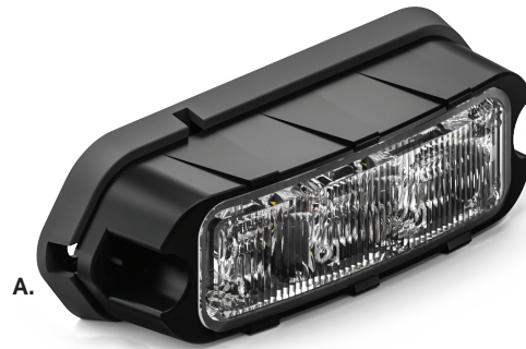
A. Q3 Surface Mount